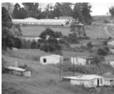
Rural school setting