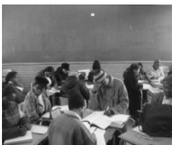
• Contact sessions